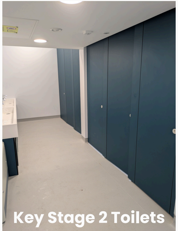
Key Stage 2 Toilets

After a busy summer of building works, we have so many improvements to the school!