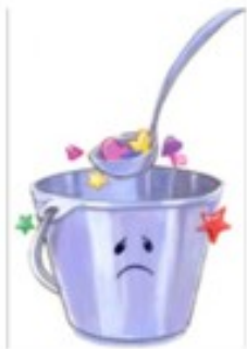
Being a bucket dipper