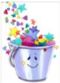
Being a bucket filler

As part of our Behaviour Curriculum, at Wildmoor Heath, from the start of Reception all the way to Year 6, we use buckets to describe how we feel and how others have made us feel. For positive behaviour choices, we say that "you have filled my bucket". For negative behaviours, we say that "you have dipped from my bucket".