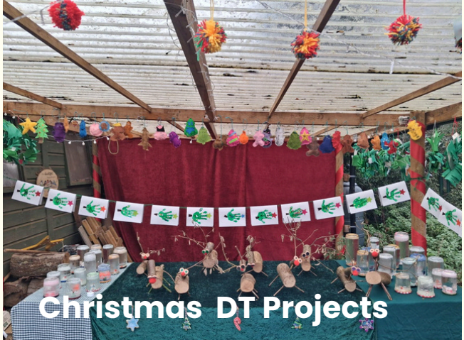
Christmas DT Projects